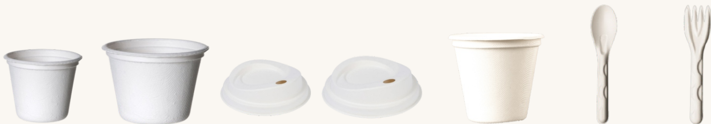
60 ML CUP 110 ML CUP 70 MM LID 90 MM LID 8 OZ 250 ML GLASS 160 MM SPOON 160 MM FORK